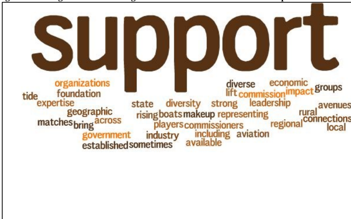
Figure 2.1 – Organizational Strengths of the Nevada Air Service Development Commission

organizations and support a critical driver in Nevada’s economy for tourism, business travel, and regional connectivity.