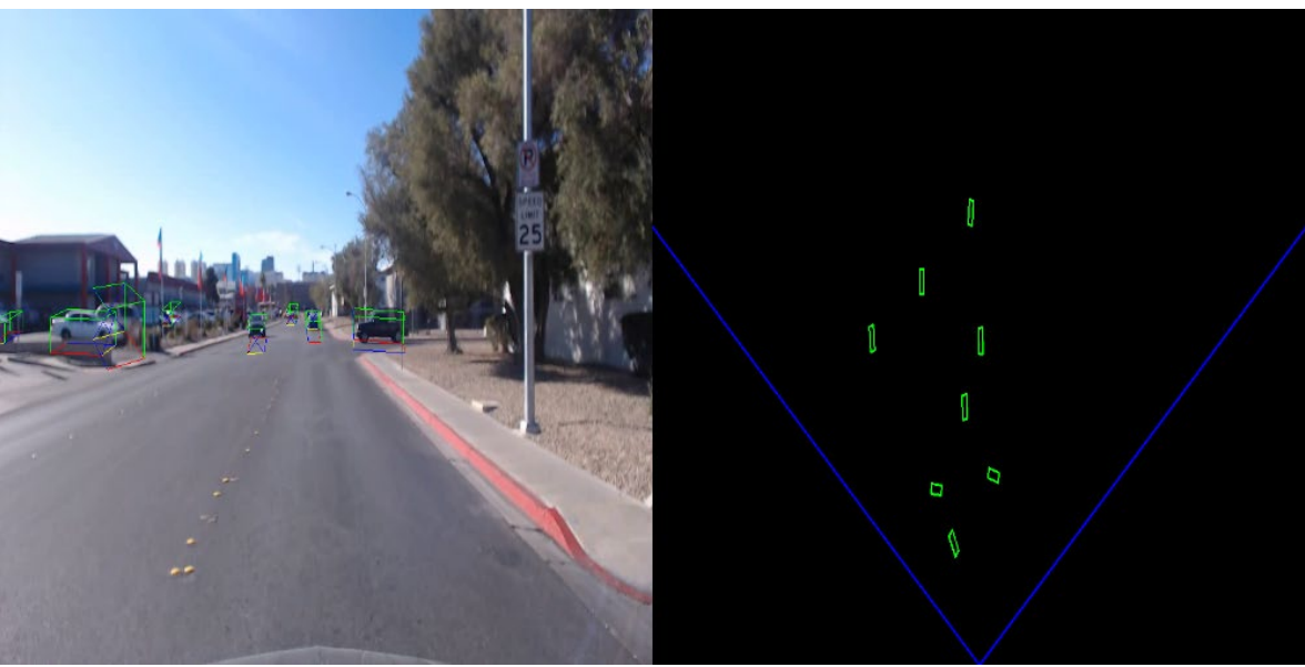
Figure 2: Monocular 3D detection. Left: dash cam image. Right: top-down bird's eye view of the scene.